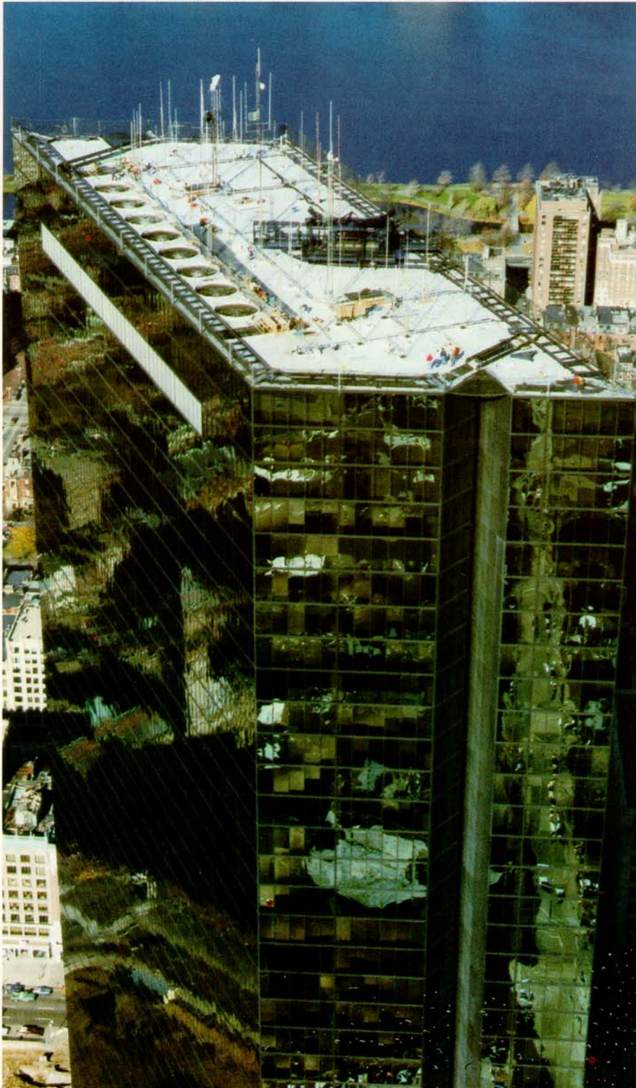
BUILDING TYPE: OFFICE HIGHRISE